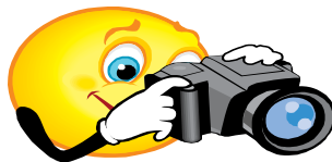
Photo retake day is OCT.19th If your child missed picture day or you were not satisfied with the photo that was taken, their picture can be retaken on the morning of October 19th. Kindergarten students that attend in the afternoon should be brought to the school by their parent in the morning if they wish to have their photo retaken.